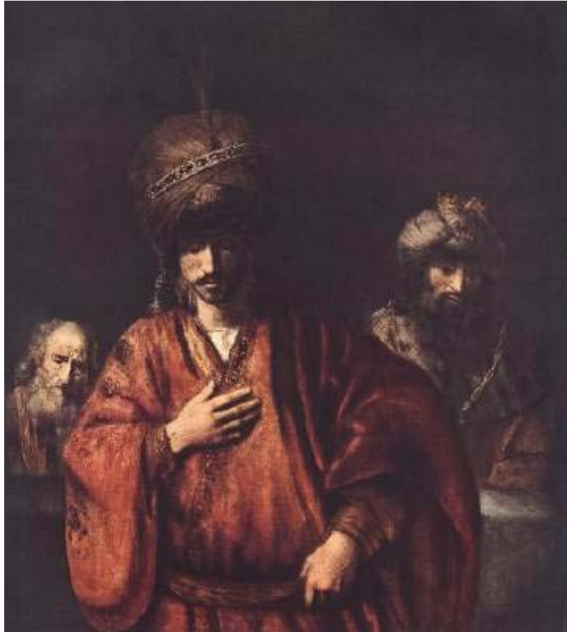
"David and Uriah" by Rembrandt, 1665

The scripture passages this morning reveal the ways that even those people who seek to be faithful to God are subject to human frailty and the distorting power of sin. David, the king whom God appointed because he was a "man after his own heart," instead pursues a destructive path of adultery, deception, and ultimately murder. In the gospel passage from John 6, the disciples are described as being terrified at the sight of Jesus walking on water in the midst of a dark storm. The disciples of Jesus are led by their anxieties and fears rather than their faith and trust.