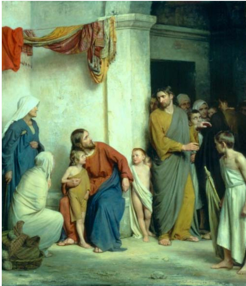
"Christ and the Children" by Carl Bloch, 1875

☞ Keeping the heart of the University listening to the heart of God ☞