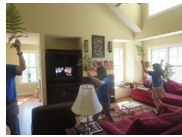
One family creatively used fern leaves to celebrate Palm Sunday at home