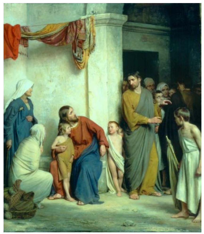
"Christ and the Children" by Carl Bloch, 1875

≈ Keeping the heart of the University listening to the heart of God «