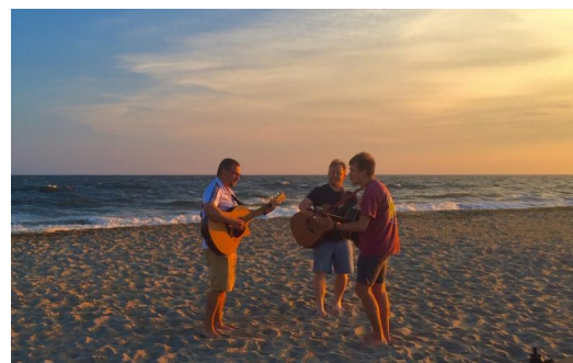
Preparing for worship on the beach