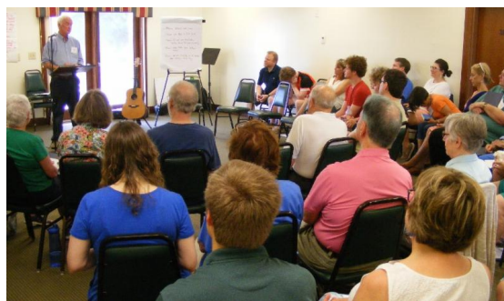
Adults & youth hear about discernment