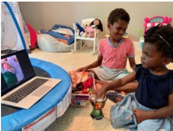
A child and her older brother watch Wee Praise together

I urge you to ask for help as we continue this journey into the unknown. I know my family has faced a lot of difficult decisions these past few weeks. I imagine you all are having to make similar decisions. Do not hesitate to call or email the Congregation if you need any sort of support.