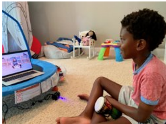
Later, the brother watches Godly Play