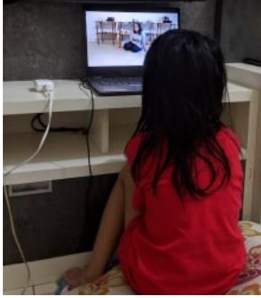
Watching Godly Play from Indonesia