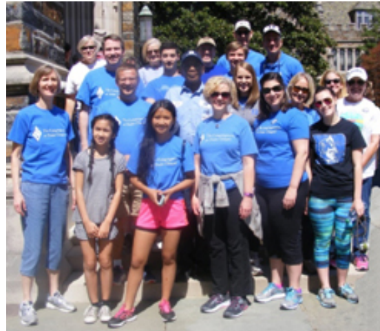
2017 CROP Walkers