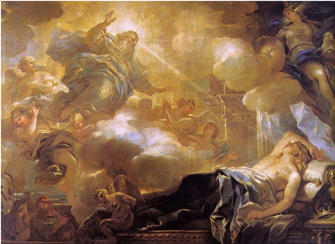
"Dream of Solomon" by Luca Giordano, 1693

∞ Keeping the heart of the University listening to the heart of God ∞