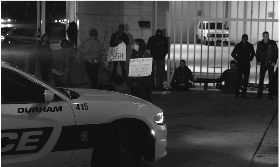
Demonstrators stop the progress of a Durham police car's entry into the jail.

In the current political environment, we must put our bodies on the line to defeat profit-driven white supremacy. We are members of religious communities in Durham, and we are outraged about what is happening inside the jail. The people inside the jail are friends, neighbors, and loved ones [and we hope to amplify their voices]. We are acting because we can no longer stand for systems where some profit off of the abuse and marginalization of Durham citizens.